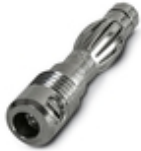
Test plugs, color: silver