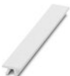
Zack marker strip, can be ordered: Strip, white, labeled according to customer specifications, mounting type: snap into tall marker groove, for terminal block width: 16 mm, lettering field size: 10.5 x 16 mm, Number of individual labels: 5