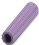
Insulating sleeve, color: violet