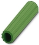
Insulating sleeve, color: green