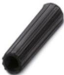
Insulating sleeve, color: black