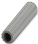
Insulating sleeve, color: gray